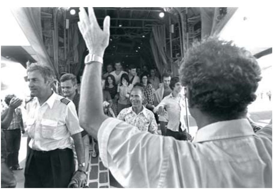
The Mossad obtains intelligence that assisted in the release of the hostages in Entebbe